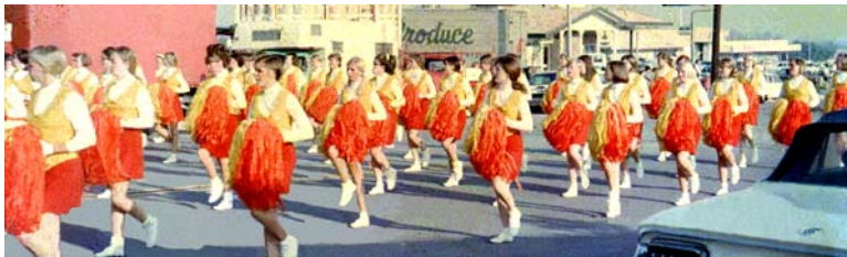
1971 Chatsworth High School Drill Team in 4 th of July Parade

Do you have any Chatsworth Parade Photos you can share with us? Email them to annvincent@aol.com or contact me and I will scan them for you. We would love to add them to our collection.