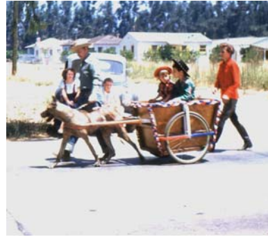
Janess Moving and Storage with Girl Scout troop 81 - 1960 photos - Cub Scouts riding in Pony Cart pulled by a dog