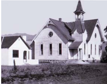
The Chatsworth Community Church is shown located on the west side of Topanga, when Topanga was still a dirt road. The parsonage house is shown on the left.

The Chatsworth Community Church, built in 1903, was originally located at 10051 Topanga Canyon Boulevard. It was a landmark in the community for sixty years before it was moved to its present location within Oakwood Memorial Park, at 22601 Lassen Street, Chatsworth.